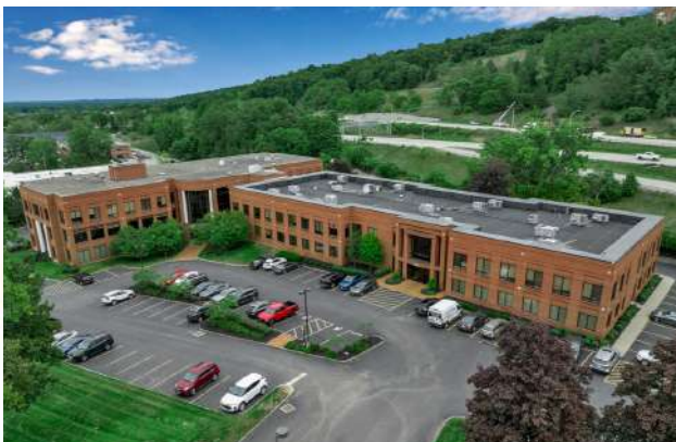
Headquarters at Rochester

We have highly qualified professionals working with us to deliver our Dynamics projects. These include Functional Consultants (CPA, Industry Expert), Technical Consultants, Microsoft Certified Professionals and, Project Managers (PMP & PMI-ACP, Dynamics Sure Step).